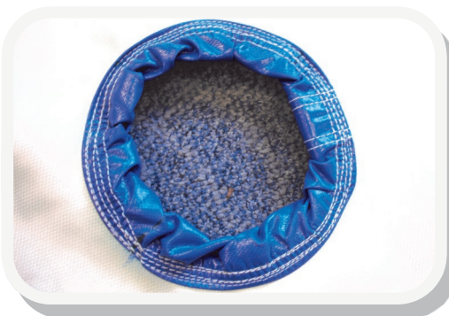
Barrel Neck Press Cloth with impervious neck